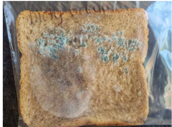
Dirty bread after 1 week