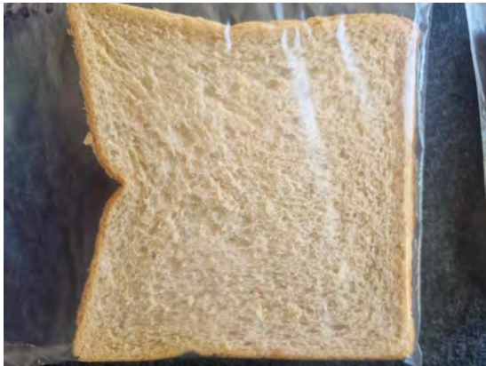
Clean bread after 1 week

Over the coming weeks, we will be experimenting with different kinds of food and exploring their state of matter. This is an exciting term ahead!