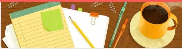
Community Survey | School Communication

So far, we have received 48 responses to the lunch order survey, providing valuable feedback . A results summary will be shared early Term 3 2023.