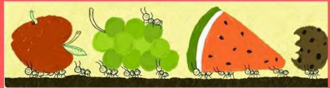
DSPS Community Survey | Lunch Orders