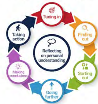
The Inquiry Learning Cycle

It was a tremendous way to start the term and I know that our staff are very excited to be delving into some different practice to further support our children.