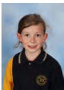
5/6P ~ ARCHER

For displaying an amazing growth mindset and an appetite to learn during this week's Math architect challenge. I have been impressed in your ability to find the volume of different spaces, by multiplying with decimals. Well done and keep up the amazing effort!