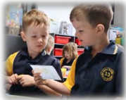
Respect & Care

401 Dana St, Ballarat. Phone 53321 301 email: ballarat.ps.dana@education.vic.gov.au