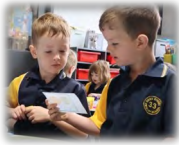
Respect & Care