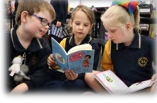
Inclusion, Tolerance & Understanding