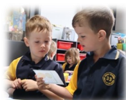
Respect & Care

401 Dana St, Ballarat. Phone 53321 301 email: ballarat.ps.dana@education.vic.gov.au