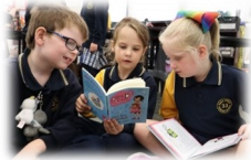
Inclusion, Tolerance & Understanding