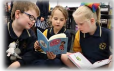
Inclusion, Tolerance & Understanding