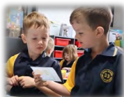
Respect & Care