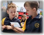
Respect & Care